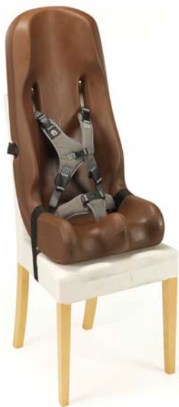
Attach to a chair

Sitters can be used in a variety of ways