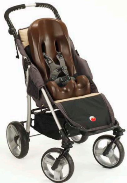
EIO Push Chair for Sizes 1,2 (page 20)