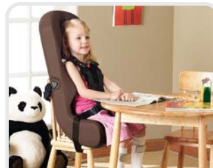
Attachment straps for securing to a standard chair