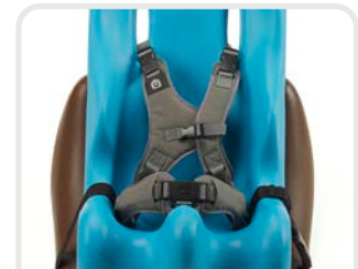
Adjustable 5-point harness