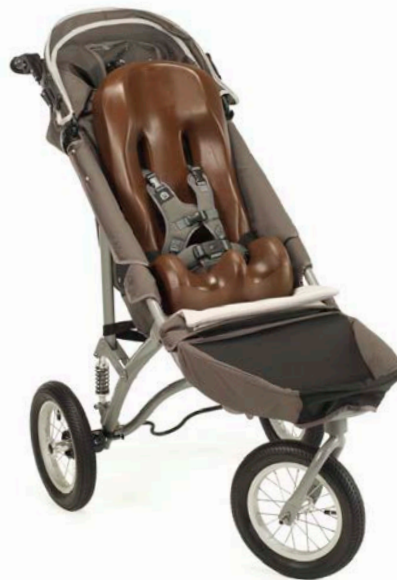
Jogger for Sizes 1,2 (page 22)