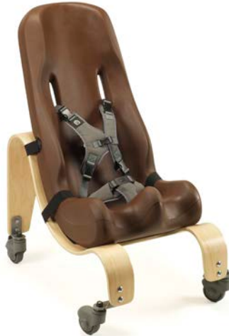
Sitter with Mobile Base