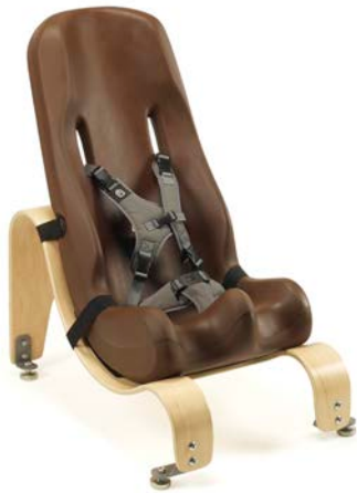
Sitter with Stationary Base