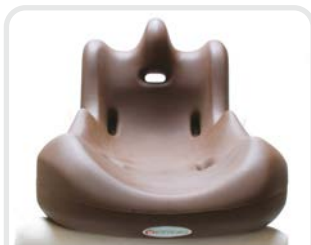
Contoured head and lateral support, shown as top view