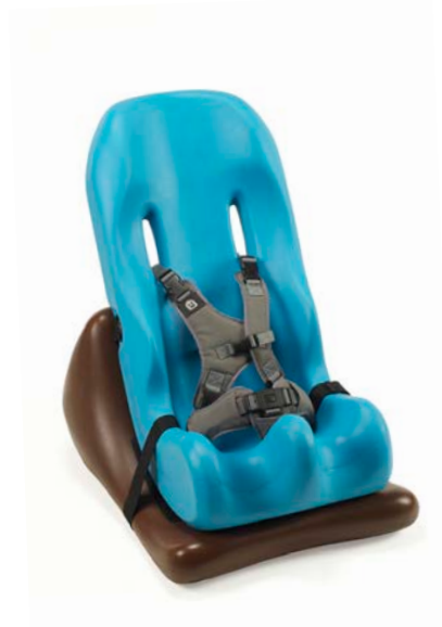
Floor Sitter Kit for Sizes 1,2,3